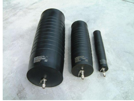
Inflatable Blank Stopper

The Pipe Equipment Specialists' range of Inflatable Pipe Stoppers can be used to seal and test all type of pipes from 35mm up to 1200mm.