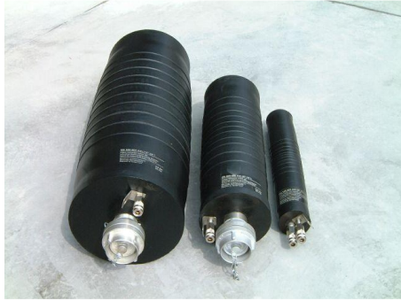
Inflatable Test Stopper